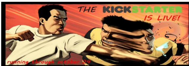
KungFu Star Comic Book