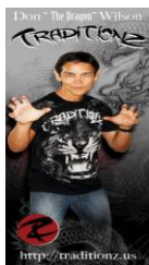
Master Don Wilson