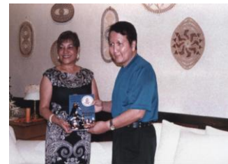
Presenting WHFSC Book to Senator Judith Won Pat of Guam, then Speaker of the Guam Legislature