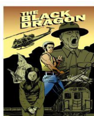
Black Dragon Comic Book