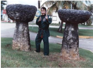
Between two of Guam's Latte Stones at entrance to Toto Village where I lived prior to U.S. Mainland