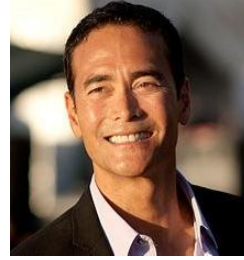
Master Mark Dacascos