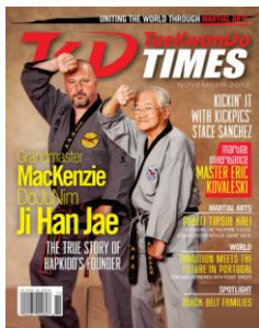
Supreme GM Ji Han Jae graces the cover of TaeKwonDo Times Nov. issue